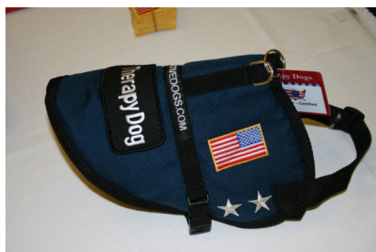
SAMPLE OF FLAG AND STAR PLACEMENT ON VEST

We need members to volunteer for these events/fundraisers in order to make them happen.